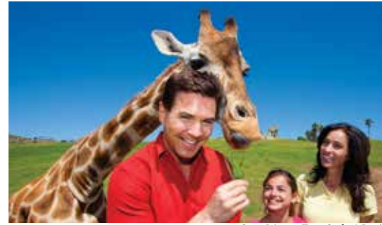
San Diego Zoo Safari Park