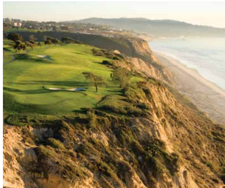
Torrey Pines Golf Course