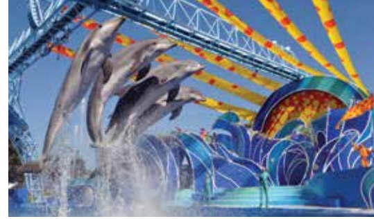
Sea World San Diego