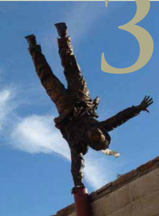
3 :: Daniel Stern Handstand, 2012 Bronze Sculpture Coronado Community Center 1845 Strand Way, Coronado

This piece by actor-artist Daniel Stern provokes a sense of fun, surprise and good cheer for residents and visitors. Stern, who may be best known for his role in the movie "Home